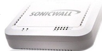
SonicWall's TZ100 is a great fit for home and home office protection.